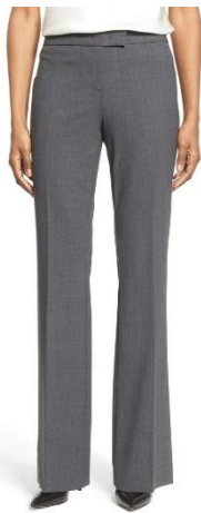
Straight leg fit