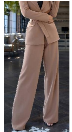
Legs too wide