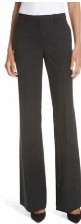
Slight boot cut/flare