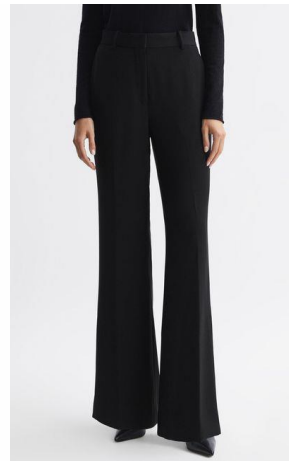
Bottoms too flared