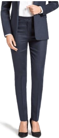
Tapered, not skinny fit.