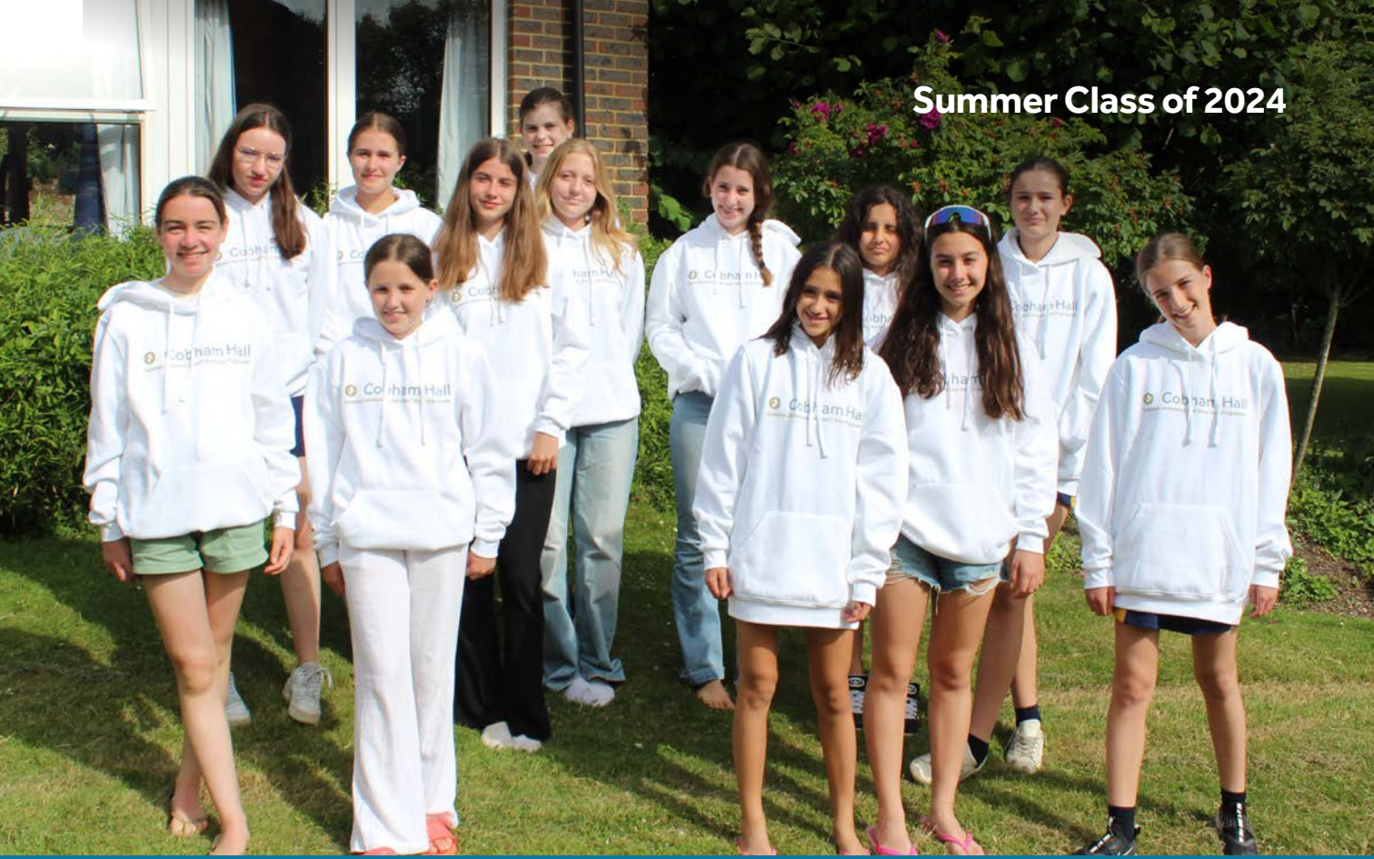
Summer Class of 2024

“Everyone was kind and friendly, I felt very welcomed.”