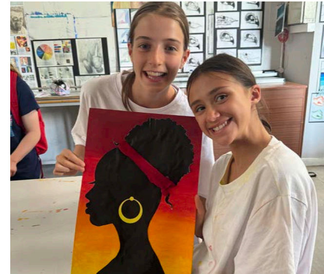
Art Workshop: ‘Invisible Women’ Campaign

Curriculum Enhancement is an innovative week of creativity and adventure that offers our Summer Immersion students the chance to learn new and essential skills alongside their Cobham Hall classmates, while engaging in immersive and fun learning opportunities.