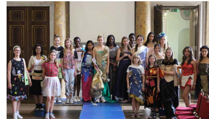
Recycled clothing fashion show