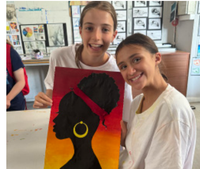
Art Workshop: ‘Invisible Women’ Campaign

Curriculum Enhancement is an innovative week of creativity and adventure that offers our Summer Immersion students the chance to learn new and essential skills alongside their Cobham Hall classmates, while engaging in immersive and fun learning opportunities.