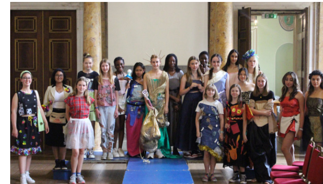
Recycled clothing fashion show